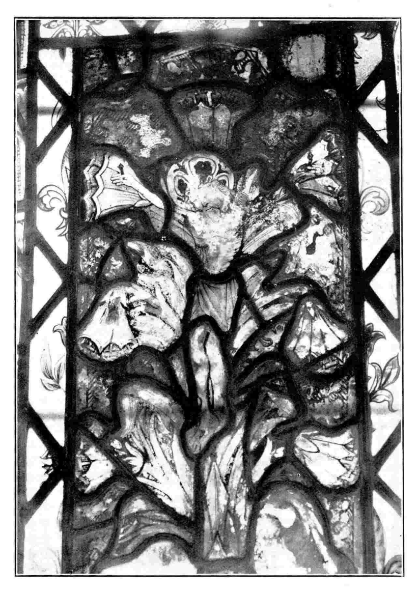
LILY CRUCIFIX. LONG MELFORD,